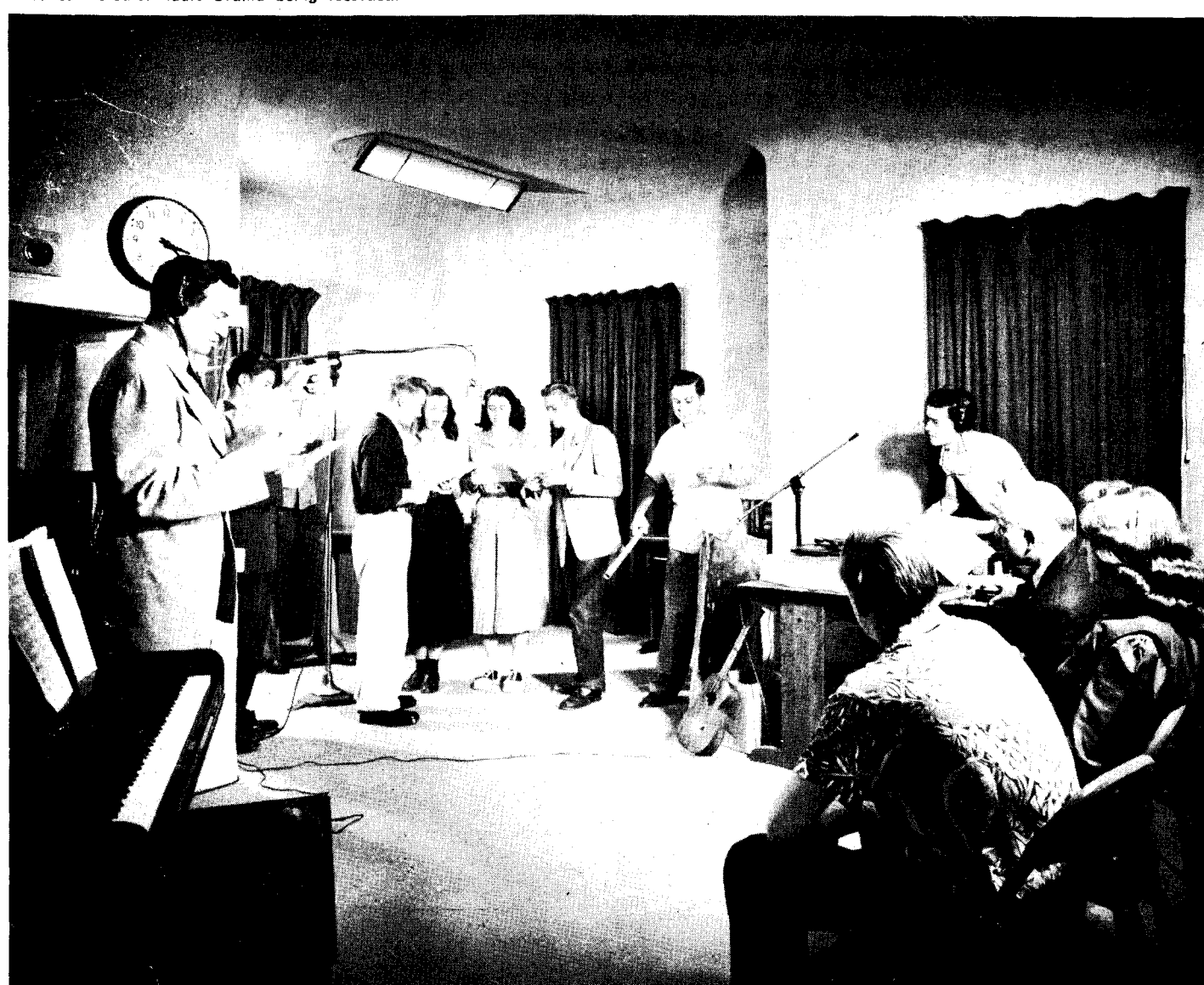
Broadcast Studio: Radio Drama being recorded.

the campus during the next five years. These plans contemplate erection of three new buildings and other changes, improvements and additions, which will provide Ambassador College with a truly fine and thoroughly adequate plant in every respect. Work is now proceeding on clearing and developing the new athletic field, adjoining the campus across Terrace Drive, to the east. We expect to have this in operation for softball by spring. The growth and development of Ambassador College during its four and a half short years is nothing short of miraculous.